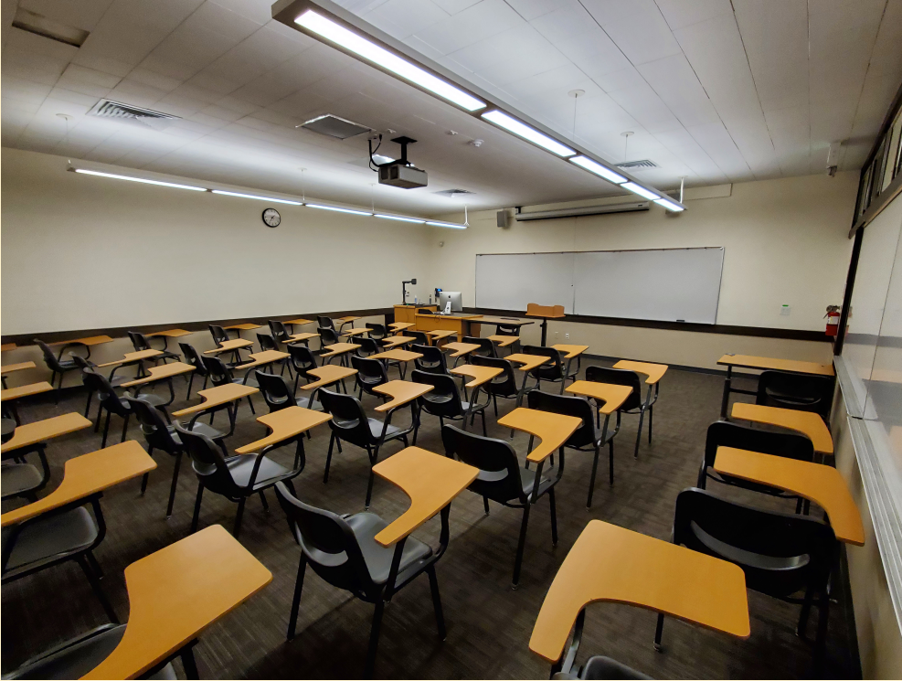
That was then ...