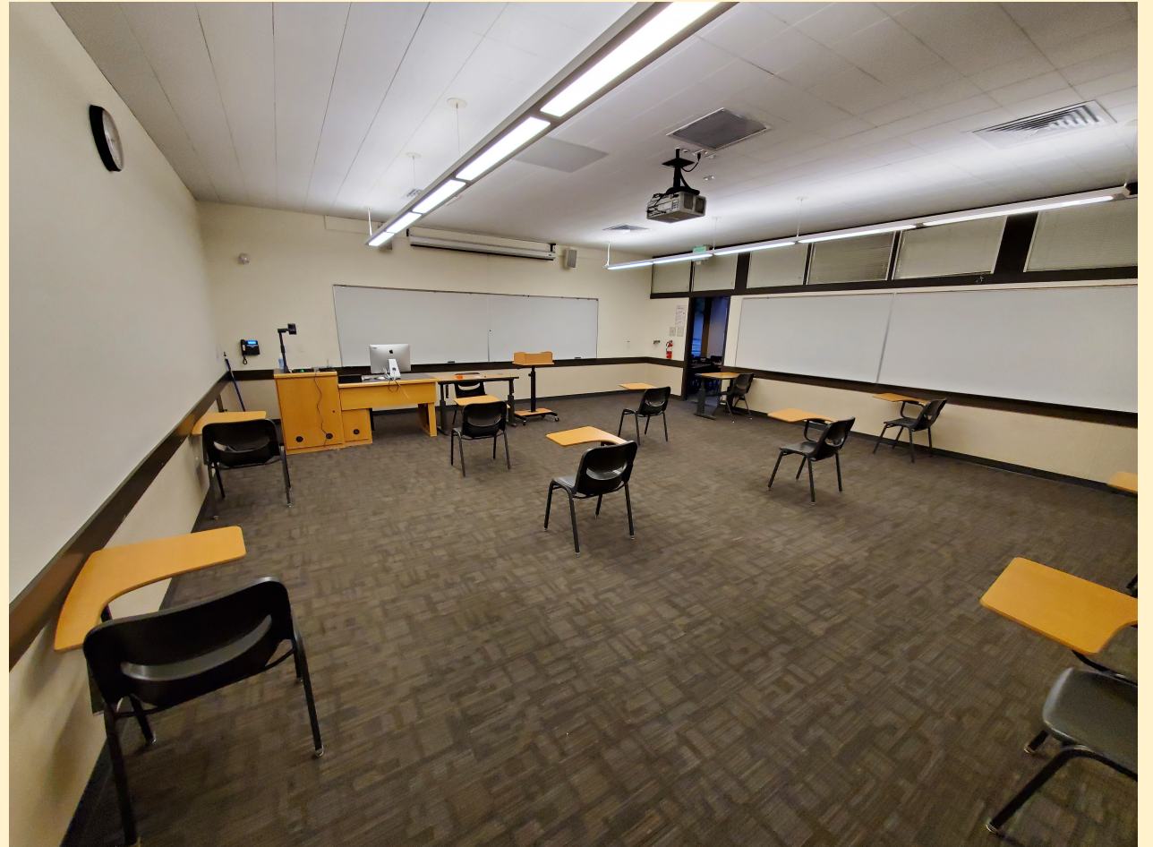
This is now